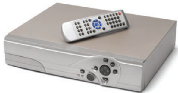
Example Application: DVR