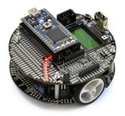
Pololu m3pi robot controlled by an ARM mbed development board.

The key feature of the m3pi expansion board is that it enables the use of ARM's powerful 32-bit mbed development board as the robot's high-level controller, offering significantly more processing power and free I/O lines than the 3pi's built-in 8-bit AVR microcontroller. The base 3pi robot ships preprogrammed to serve as a serial slave, so all you need to get started is an mbed controller (sold separately or as part of a combination deal with the m3pi robot). The mbed plugs directly into a socket on the expansion board (no soldering is required) and connects to all of the hardware on the m3pi expansion board as well as the serial lines of the 3pi base. Library support and sample programs for the m3pi are available from mbed.org, making it easy to get your mbed-controlled m3pi robot up and running.