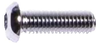
6mm Cap Screws x24