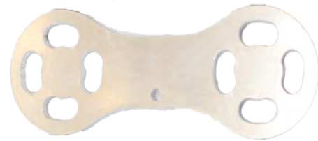
Bus Bar x6