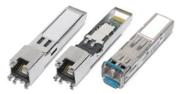
SFP modules: copper and fiber

The Alaska 88E1112 10/100/1000 Mbps Ethernet PHY offers an integrated, flexible solution for system level or SFP module applications. Supporting both copper and fiber media applications, with additional SFP module support, the 88E1112 is a key ingredient for any type of SGMII/SERDES/copper combination application. The small footprint facilitates SFP module applications, while the auto-media detect capability offers flexible media support.