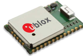
CAM-M8Q: 9.6 x 14.0 x 1.95 mm