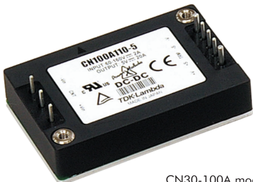
CN30-100A model shown.