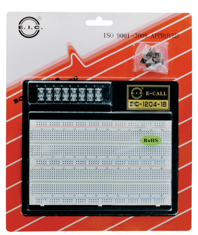
EIC-1204-1B (1560 Tie-point)

Board: 165.1*54.6*8.5mm Plate: 183*95*0.8mm