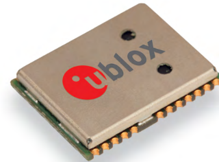
NEO-M8 series: 12.2 x 16.0 x 2.4 mm